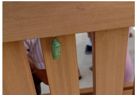
Monarch Butterfly Chrysalis on bench in the Gazebo