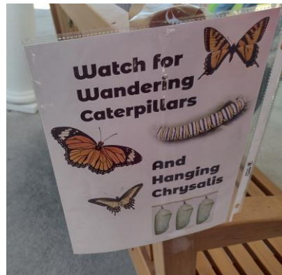
Warning sign on bench in the gazebo