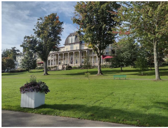
160+ year old Athenaeum Hotel

Luckily the answer is NO! Road Scholar runs the same or similar program in January and February in St. Petersburg, Florida. The 2024 dates are: January 14, January 28, and February 18. Check out: RoadScholar.org