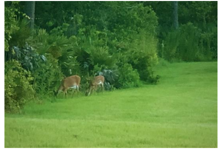
Deer along our Back-Road