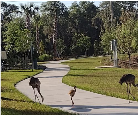
Sand Hill Cranes with growing baby