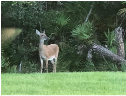
Deer along our Back-Road